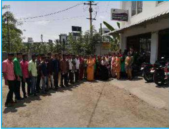
Industrial visit at Purple Pro