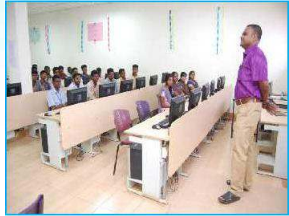
Resource person addressing the students