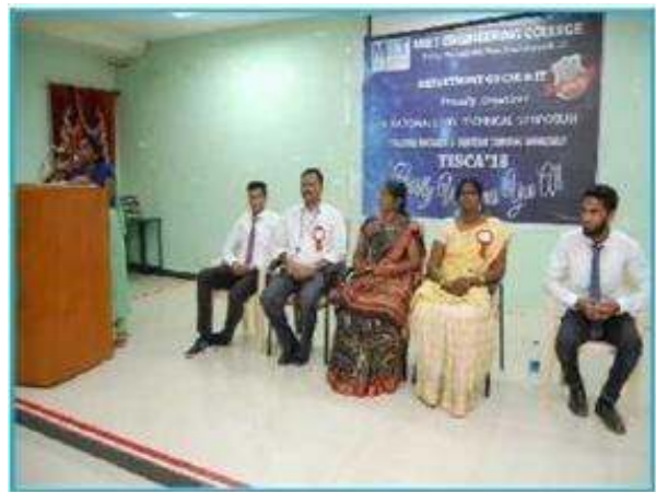
TISCA-'18 Valedictory function