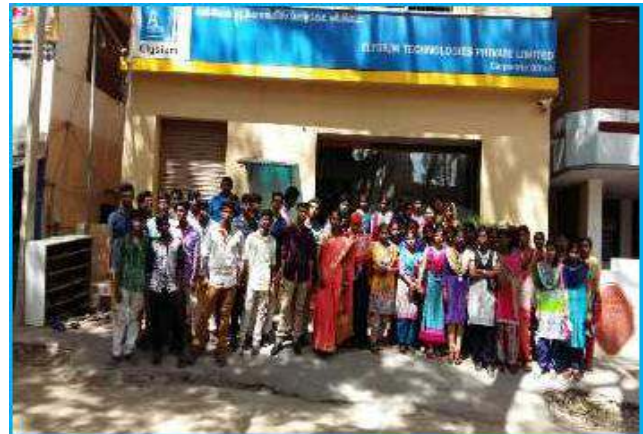
Industrial Visit at Elysium Technologies