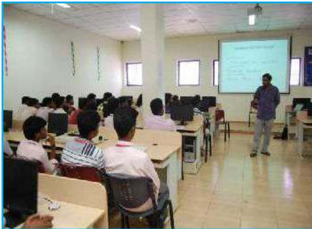
Students attending workshop