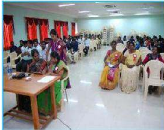
Paper presentation in TISCA-18